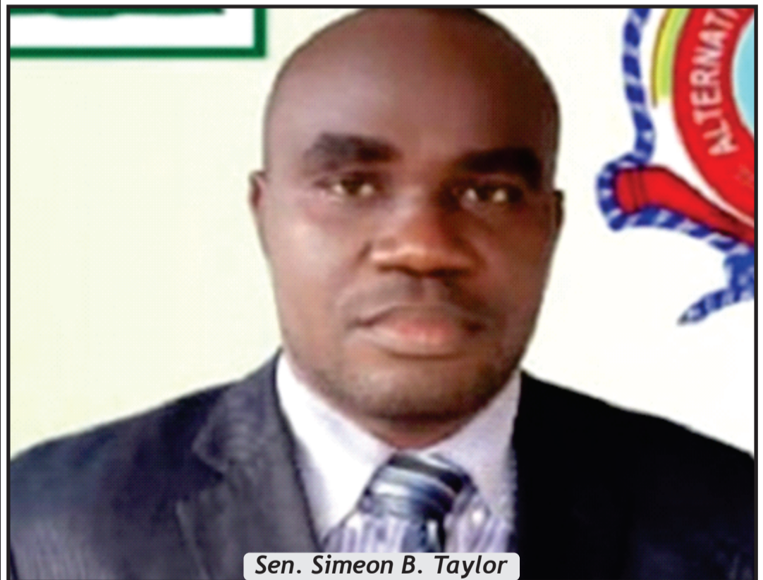
Sen. Simeon B. Taylor

He further called on the Senate to summon the Minister of Local Government or Internal Affairs, Francis S. Nyumalin, along with the accused County officials, to explain why such a breach occurred under