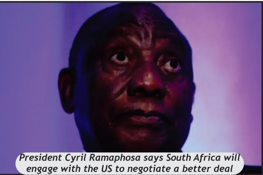
President Cyril Ramaphosa says South Africa will engage with the US to negotiate a better deal

must move away from these long-term, and very persistent, trade deficits engendered by South Africa's tariff, and non-tariff, policies and trade barriers," Trump said in his letter. "Starting on August 1, 2025, we will charge South Africa a tariff of only 30% on any and all South African products sent to the United States, separate from all sectoral tariffs," he added. Trump said that if South Africa were to increase its tariffs in response to his announcement, the amount it chooses to raise them by would be added on top of the existing 30%. "If you wish to open your heretofore closed trading markets to the United States, and eliminate your tariff and non-tariff policies and trade barriers, we will, perhaps, consider an adjustment to this letter." In response, Ramaphosa contested the new tariffs, saying the issue was still under consideration by