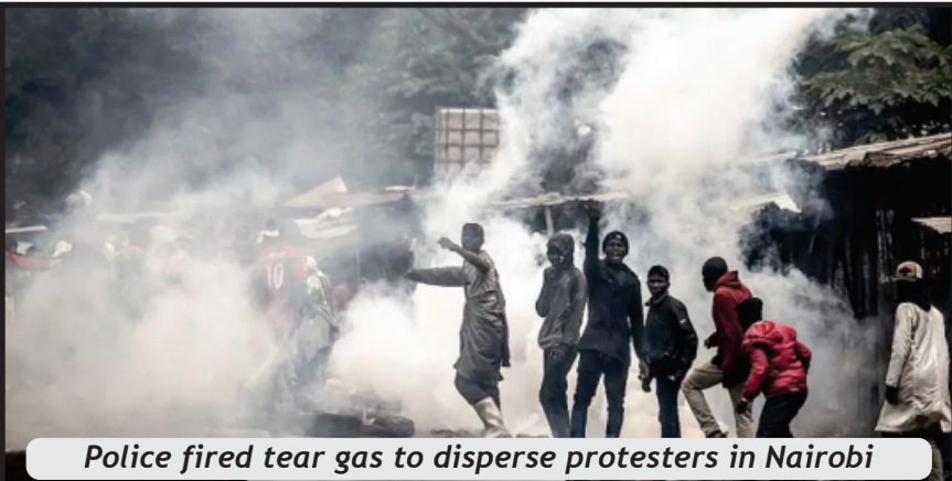
Police fired tear gas to disperse protesters in Nairobi

From early in the morning, hundreds of commuters and overnight travellers were stranded at checkpoints, some more than 10km (six miles) from the city centre, with only a few vehicles allowed through. Roads leading to key government sites - including the president's official residence, State House, and the Kenyan parliament - were barricaded with razor wire. Some schools advised students to stay at home. But clashes broke out in parts of the capital as demonstrators lit fires and attempted to breach police cordons. Officers responded with tear gas and water cannon. BBC