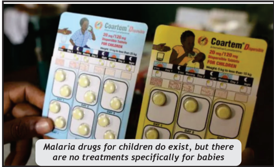
Malaria drugs for children do exist, but there are no treatments specifically for babies