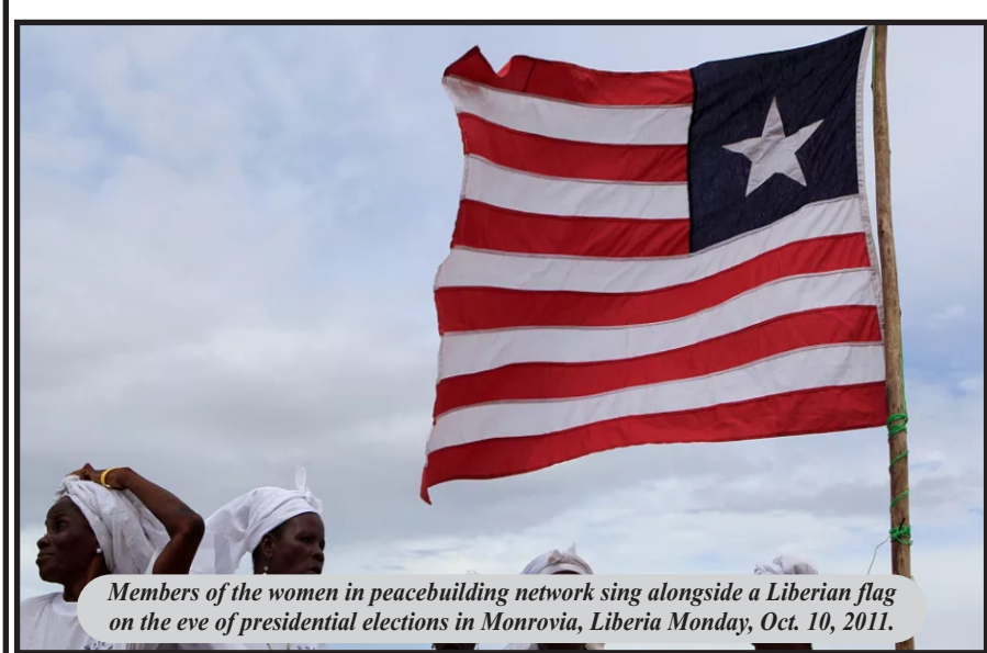
Members of the women in peacebuilding network sing alongside a Liberian flag on the eve of presidential elections in Monrovia, Liberia Monday, Oct. 10, 2011.

ensure those applying for admission to the United States do not intend to harm Americans and our national interests,” the US State Department said in a press release on 18 June, adding that “a US visa is a privilege, not a right.” Since returning to office in January, Donald Trump has cracked down on foreign nationals who want to enter the US and those already in the country. Tourists and legal permanent residents of the US, including nationals of Canada, Germany, and the United Kingdom, have also been detained trying to enter the country.