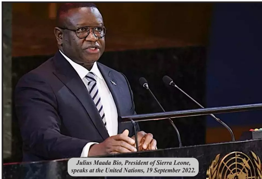
Julius Maada Bio, President of Sierra Leone, speaks at the United Nations, 19 September 2022.

In the past few years, ECOWAS has struggled with the departure of Mali, Burkina Faso and Niger which have all faced military coups. All three junta left the bloc and created their security partnership, the Alliance of Sahel States. They have cut ties with the traditional Western allies, ousting French and American military forces, and instead sought new security ties with Russia. The three countries have been the hardest hit by jihadist violence in recent years.