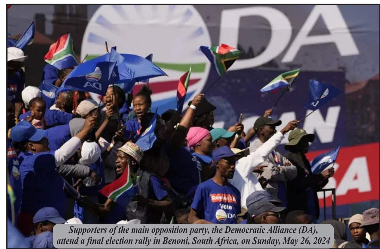
Supporters of the main opposition party, the Democratic Alliance (DA), attend a final election rally in Benoni, South Africa, on Sunday, May 26, 2024

Afghanistan, Myanmar, Chad, the Republic of Congo, Equatorial Guinea, Eritrea, Haiti, Iran, Libya, Somalia, Sudan and Yemen. The restrictions are for people from Burundi, Cuba, Laos, Sierra Leone, Togo, Turkmenistan and Venezuela, who are outside the United States and don't hold a visa. Some exceptions apply only to specific countries, like Afghanistan. Others are for most of the countries on the list, or are more general and unclear, like the