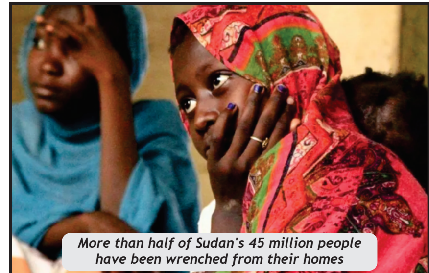
More than half of Sudan's 45 million people have been wrenched from their homes

Port Sudan, which is both the interim capital of the military government and also the main entry point for humanitarian aid. These were long-range sophisticated drones, which the army accuses the United Arab Emirates (UAE) of supplying - a charge the UAE rejects, along with well-documented reports that it has been backing the RSF during the 27-month conflict. The RSF has also expanded operations to the south of Khartoum. Hemedti struck a deal with Abdel Aziz al-Hilu, the veteran rebel commander of the Sudan People's Liberation Army-North, which controls the Nuba Mountains near the border with South Sudan. Their forces combined may be able to make a push to the border with Ethiopia, hoping to open new supply routes. Meanwhile, the RSF has been besieging the capital of North Darfur, el-Fasher, which is defended by a coalition of Darfurian former rebels, known as the Joint Forces, allied with the army.