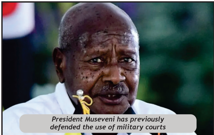
President Museveni has previously defended the use of military courts