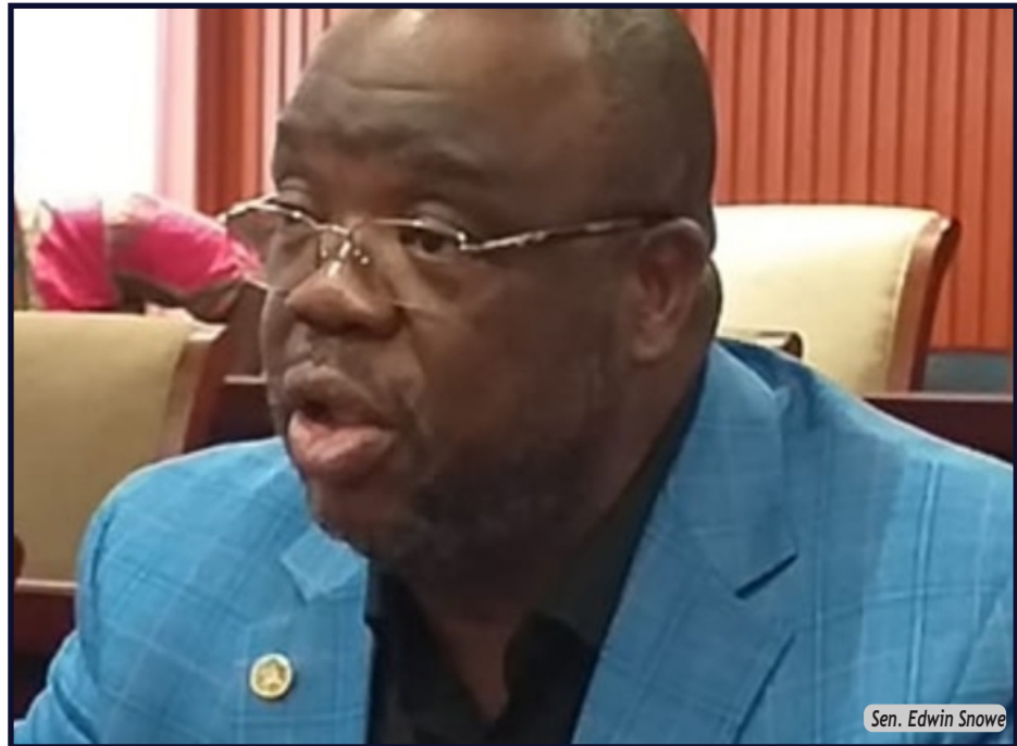
Sen. Edwin Snowe

Monrovia, Liberia, May 28, "This statement issued by the 2025 - Days after he was Government of Liberia amounts accused of subversion, to nothing less than an implicit Bomi County Senator and head of accusation of treason, one of the Liberia's Delegation to the gravest charges under our ECOWAS Parliament, Edwin constitution that I do not take Snowe, has dragged the Liberian lightly. Such an accusation is not Government through the Ministry only wholly unfounded and of Information to the plenary of defamatory but also constitutes the Liberian Senate over a serious affront to the principles allegation of subversive plot to of democracy, the rule of law, destabilize the administration of and the constitutional President Joseph N. Boakai. safeguards that protect all Senator Snowe, in a formal citizens of our Republic. communication to the 55th Furthermore, it is a disturbing Liberian Legislature dated and deliberate attempt to Tuesday, May 27, 2025 damage my reputation and cast complained of malicious aspersions on my integrity as a allegations by the government statesman, representative of the against him, noting that it is with Liberian people and a deep concern and profound responsible member of the disappointment that he draws his opposition", Snowe lamented.