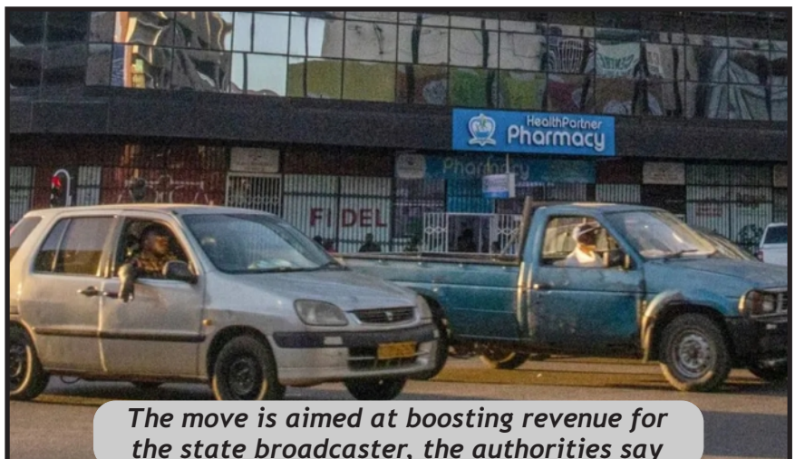
The move is aimed at boosting revenue for the state broadcaster, the authorities say

opposition has complained of unfair coverage by the broadcaster, especially during elections. ZBC has denied the accusation. Under the new Broadcasting Services Amendment Act, all motorists must now pay the radio licence fee before they can renew their vehicle insurance or obtain a licence from the Zimbabwe National Road Authority (Zinara).The changes, which were recently approved by parliament, pegs the fee at $23 per quarter, amounting to $92 per year.BBC