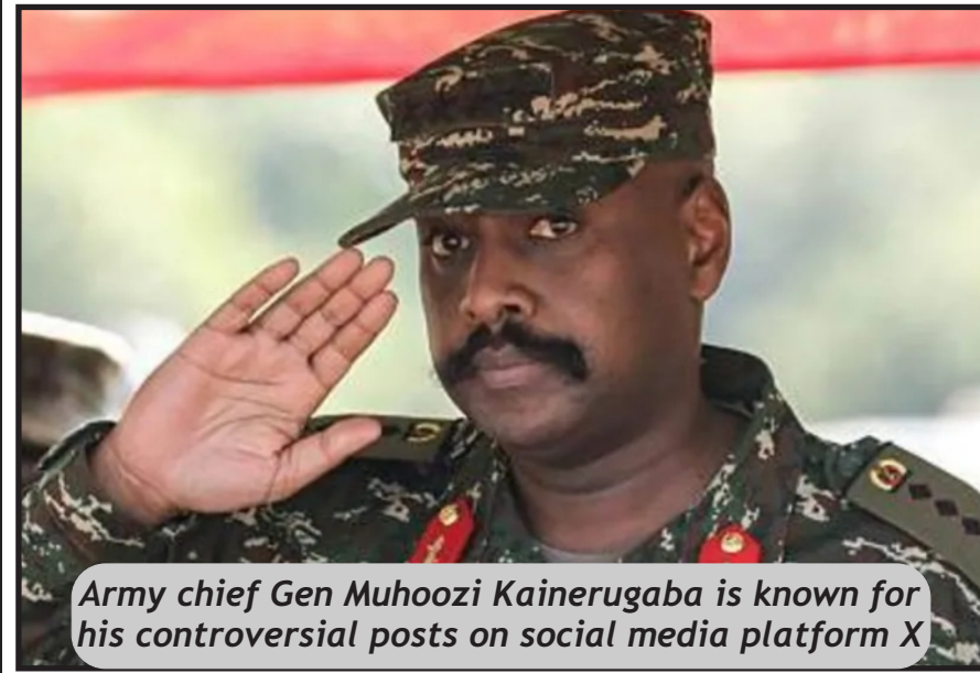
Army chief Gen Muhoozi Kainerugaba is known for his controversial posts on social media platform X