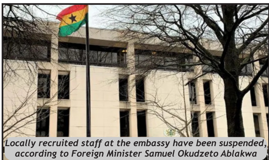
Locally recruited staff at the embassy have been suspended, according to Foreign Minister Samuel Okudzeto Ablakwa

"President [John] Mahama's government will continue to demonstrate zero tolerance for corruption, naked conflict of interest and blatant abuse of office." BBC