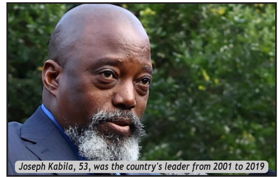
Joseph Kabila, 53, was the country's leader from 2001 to 2019

Kabila has been living outside the country, in South Africa, for the past two years. At the beginning of last month he said he would be returning to help find a solution to the conflict. BBC