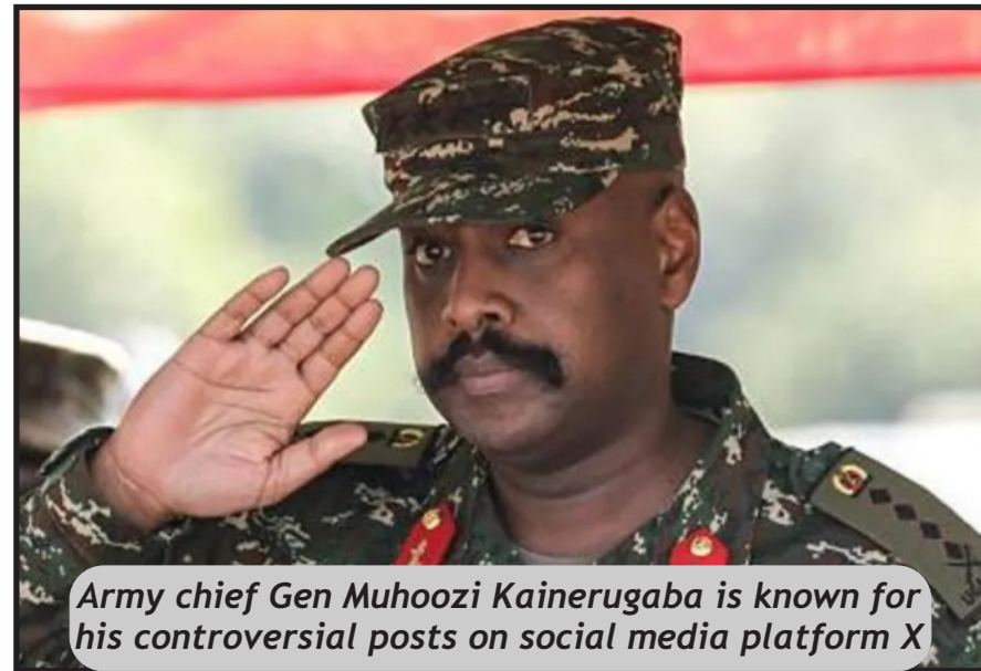
Army chief Gen Muhoozi Kainerugaba is known for his controversial posts on social media platform X