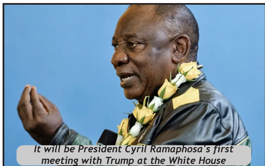
It will be President Cyril Ramaphosa's first meeting with Trump at the White House

the Trump administration - already angered by its genocide case against Israel at the International Court of Justice (ICJ). In February, the US president announced the suspension of critical aid to South Africa and offered to help members from the Afrikaner community, who are mostly white descendants of early Dutch and French settlers, to settle in the US as "refugees". South Africa's ambassador to Washington, Ebrahim Rasool, was also expelled in March after accusing Trump of "mobilising a supremacism" and trying to "project white victimhood as a dog whistle". BBC