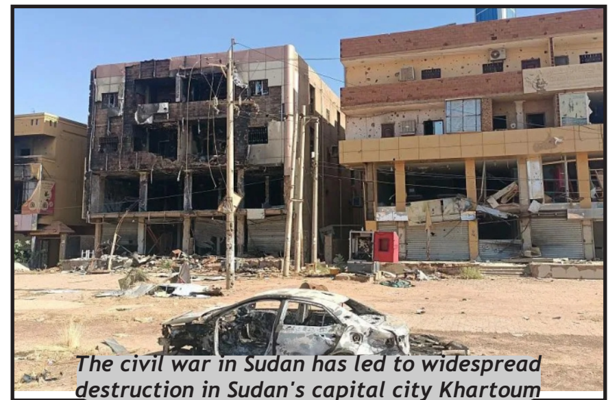
The civil war in Sudan has led to widespread destruction in Sudan's capital city Khartoum

Since the civil war erupted three years ago, thousands of people have died and millions have been displaced from their homes - creating the world's worst humanitarian crisis. BBC