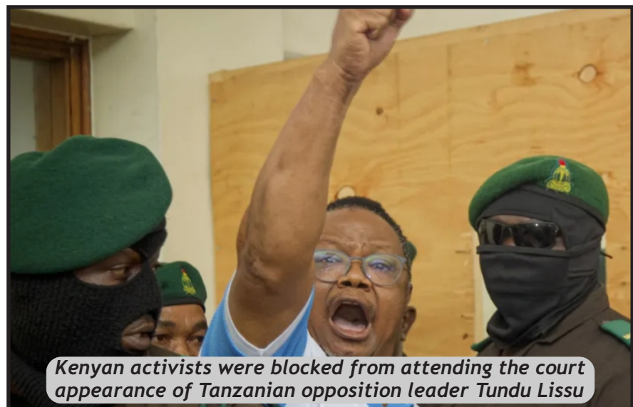
Kenyan activists were blocked from attending the court appearance of Tanzanian opposition leader Tundu Lissu

appeared in a magistrate's court after being arrested last month.