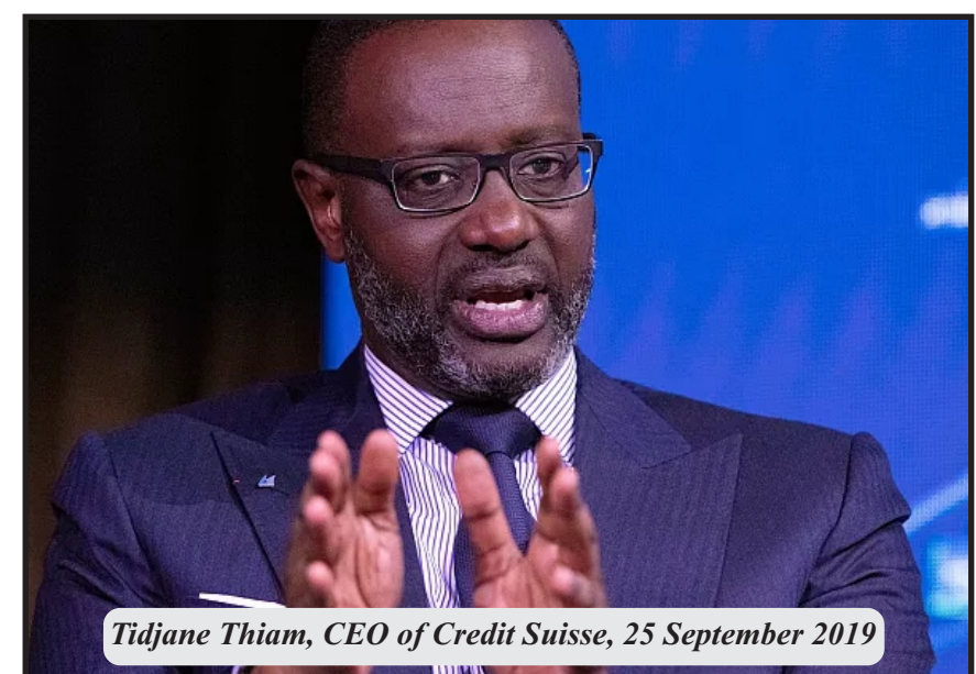
Tidjane Thiam, CEO of Credit Suisse, 25 September 2019

For Tidjane Thiam, the fight is just beginning.