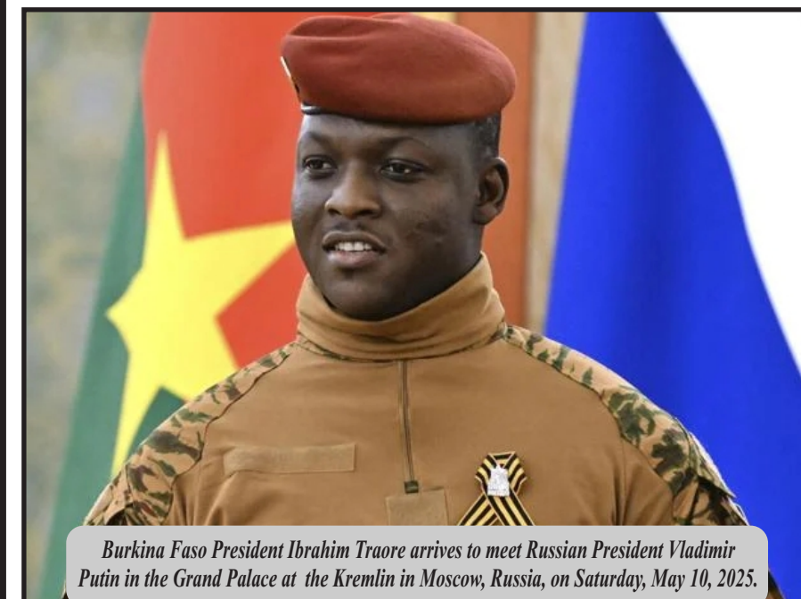
Burkina Faso President Ibrahim Traore arrives to meet Russian President Vladimir Putin in the Grand Palace at the Kremlin in Moscow, Russia, on Saturday, May 10, 2025.