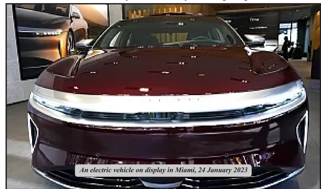
An electric vehicle on display in Miami, 24 January 2023

He added that the Authority for the Regulation and Control of Strategic Mineral Substances' Markets would consult industry players in June regarding the ban.