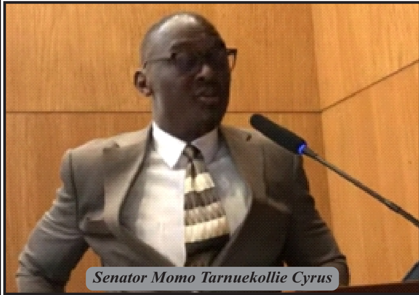
Senator Momo Tarnuekollie Cyrus

"If findings from the Ministry of Justice and the Joint Security confirm that these actions undermine our national stability, I will seek the indulgence of the Liberian Senate to mandate the Armed Forces of Liberia, through the Executive, to take immediate