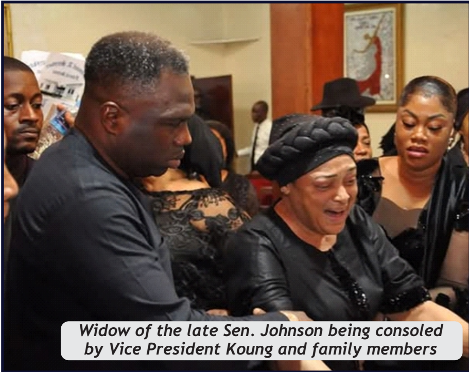
Widow of the late Sen. Johnson being consoled by Vice President Koun and family members