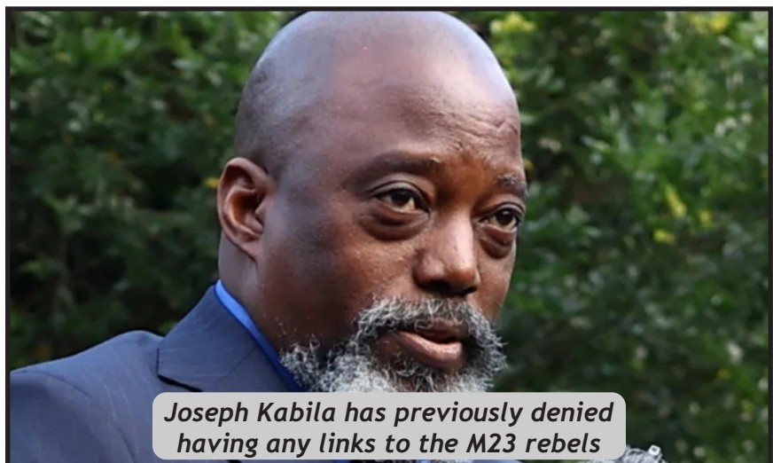
Joseph Kabila has previously denied having any links to the M23 rebels