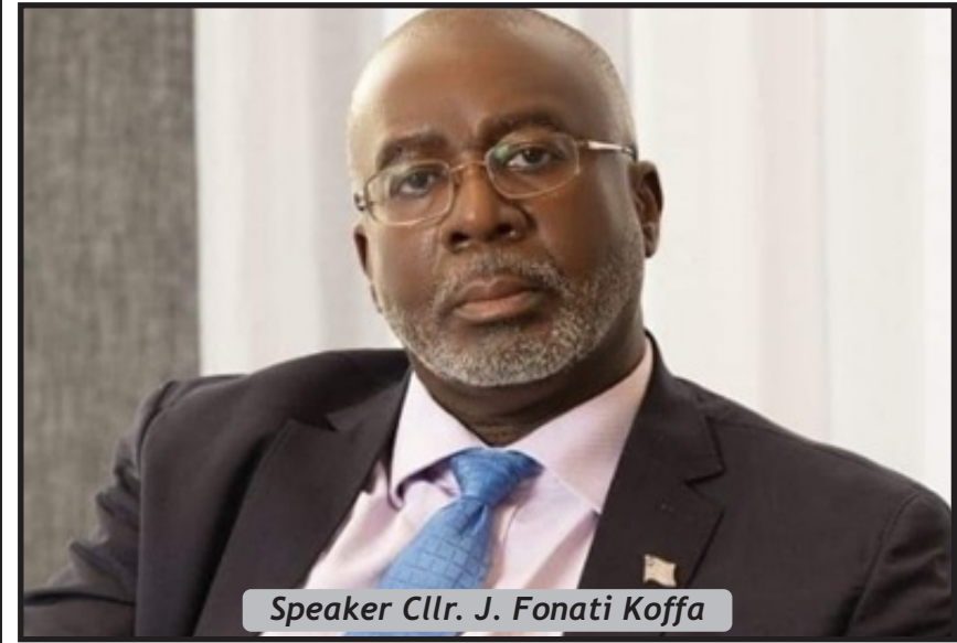
Speaker Cllr. J. Fonati Koffa

Embattled House Speaker Cllr. J. Fonati Koffa says he is yet to reach a decision about his future at the House of Representative. “We are still negotiating, if the negotiation succeeds, I will resign, if not, I will keep