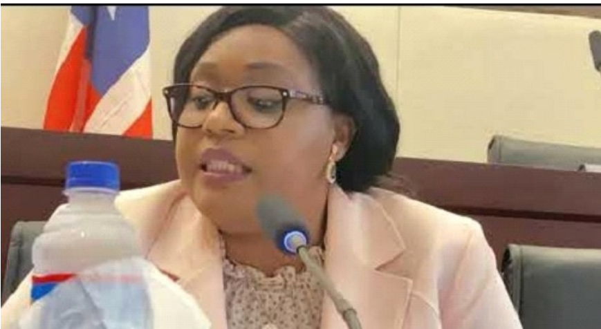
Minister of Education, Dr. Jarso Jallah Saygbe

"The technical working group on data evidence is responsible for preparing and managing the execution of this year's census and has mobilized resources for this purpose," he noted. According to him, the activities will include training data management staff, procuring equipment, upgrading their department to an education information management system, and ongoing community mobilization and public information dissemination outreach. Speaking on behalf of the Ministry of Education's senior management team, he stated that under the community engagement process for this year's census collection, they will involve the Parent-Teacher Associations (PTAs) from private, public, and faith-based schools across Liberia. Reading the activities that have already been launched by the ministry to spearhead the process, he indicated that the group began its public awareness and media community engagements on October 28, 2024 which will run until December 15, 2024. A school census tool distribution process will roll out on December 15. Following this, they will test the equipment using an online system that will allow them to collect and synchronize data for ongoing real-time analysis.